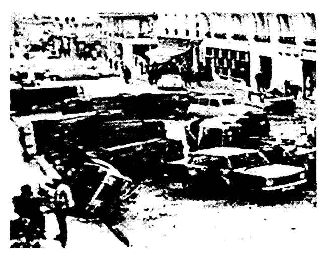
Fig. 2. Labyrinth, Paris. May, 1968.

Every orientation presupposes a disorientation. Only someone who has experienced bewilderment can free himself of it. But these games of orientation are in turn games of disorientation. Therein lies their fascination and their risk. The labyrinth is made so that whoever enters it will stray and get lost. But the labyrinth also poses the visitor a